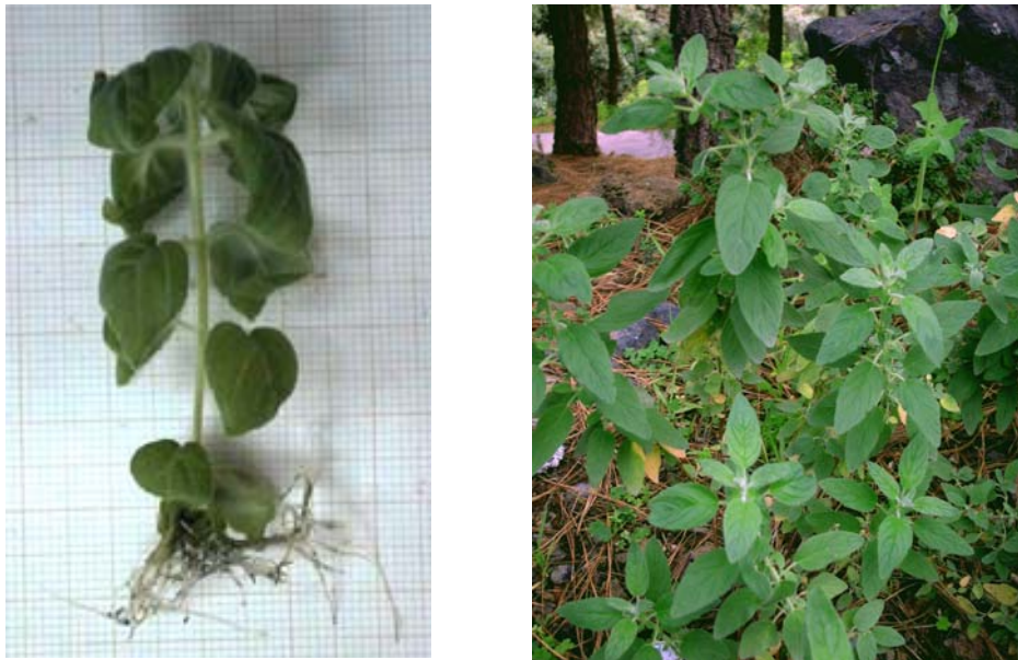
Figure 6. - In vitro rooted plant before transfer to soil (left) and plants growing at the Jardín Canario, one year after their acclimatisation (right).